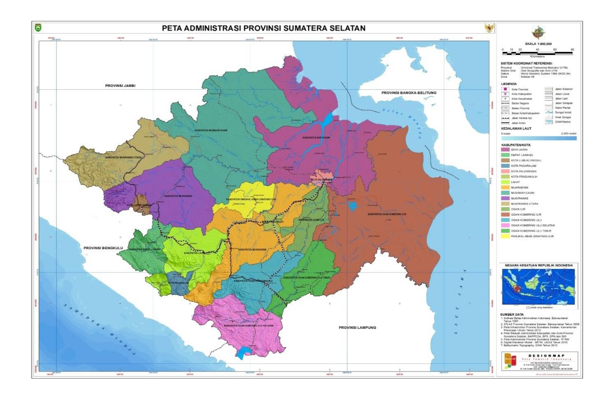
FIGURE 1 ADMINISTRATIVE MAP OF THE PROVINCE OF SOUTH SUMATRA

The number of poor population in South Sumatra Province in 2016 was 13.54%, it was still higher when it is compared with the number of poor population nationally in the same year, which was 10.86%. The number of poor population the first-highest was in Palembang city, it was approximately 203 thousand inhabitants, the second was OKI regency, it was around 134 thousand inhabitants, and the lowest poor population of the city was Pagar Alam, it was around 12 thousands (BPS, 2017). This fact shows that the development being done had not yet delivered optimal results to their GRDPs, in 2016.